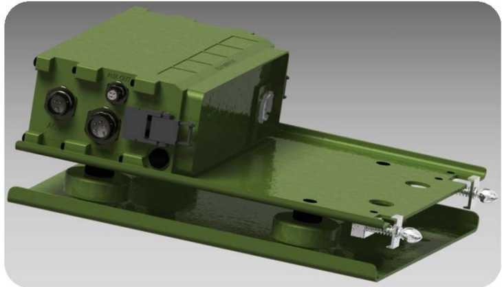
TRI-ATPS-2 and Radio Sold Separately